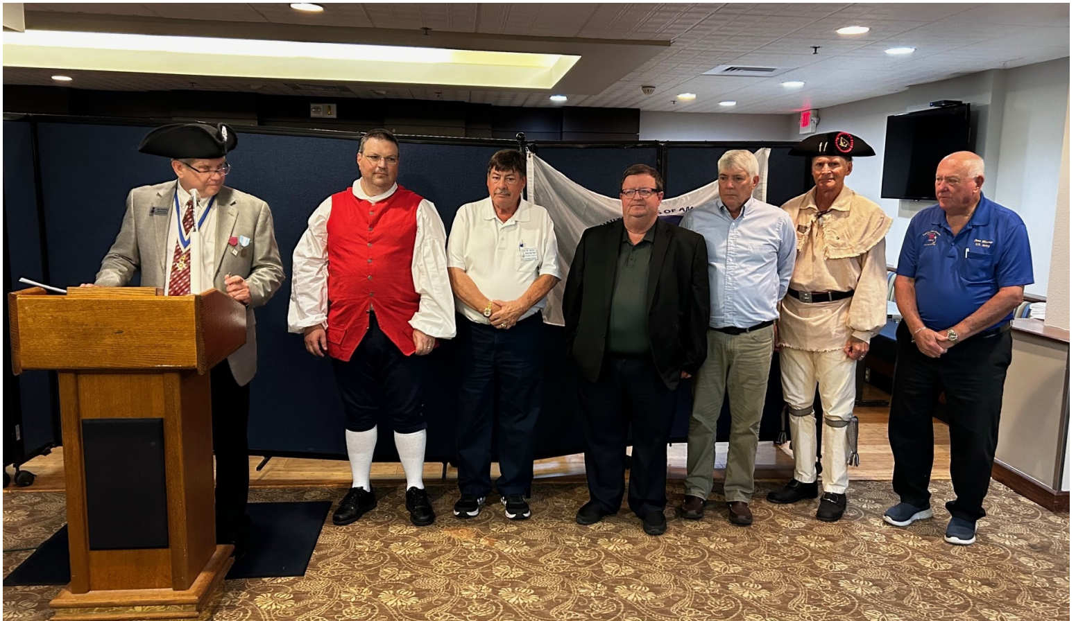
New Chapter Officers