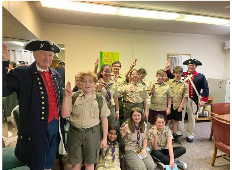
Compatriots Hunt and Ward supporting scouting community engagement event