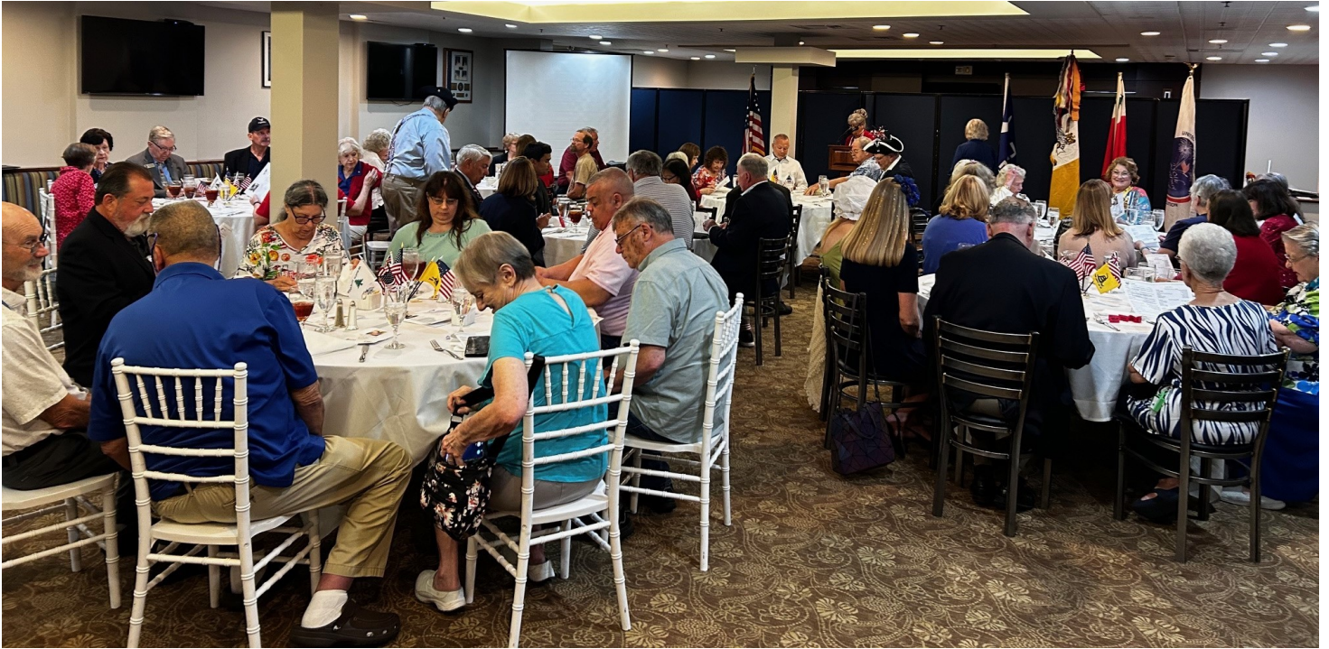
Well attended June meeting