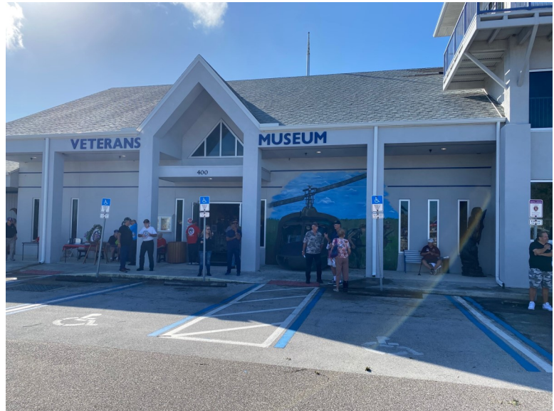
Brevard Veterans Memorial Center 400 South Sykes Creek Parkway, Merritt Island

https://veteransmemorialcenter.org/upcoming-veterans-events/