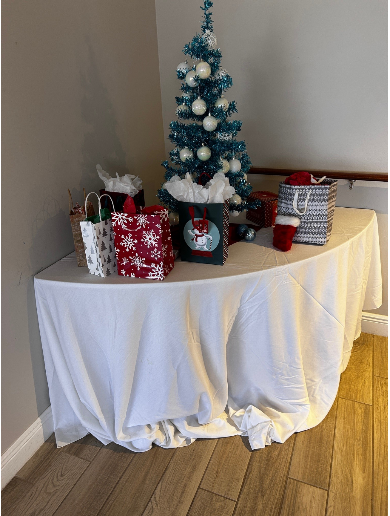
Annual Ornament Exchange