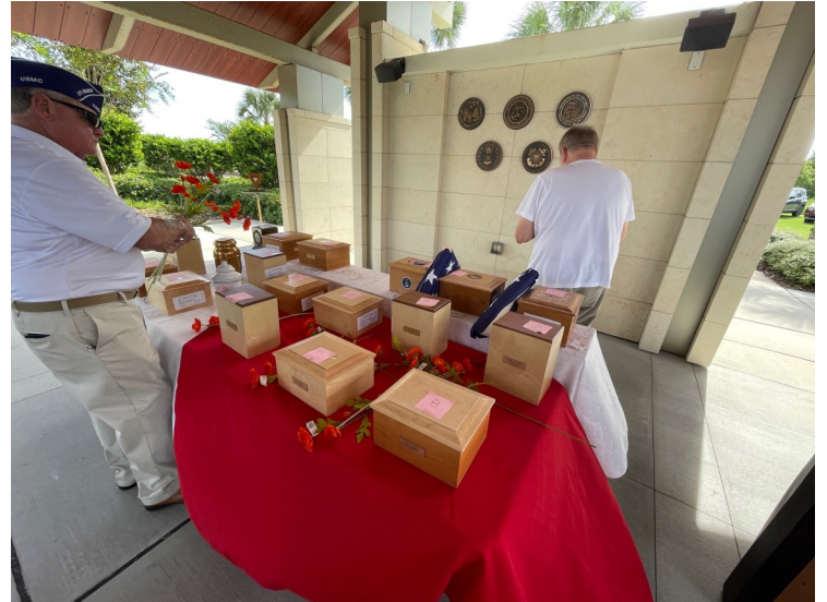
25 September